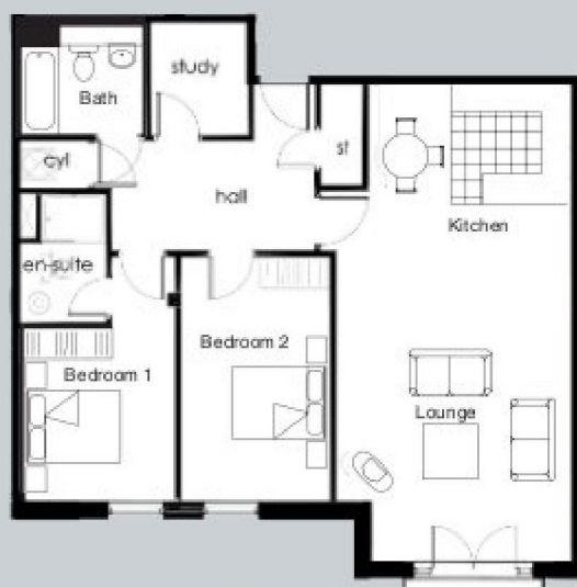
£290'000 APARTMENT 46 Three Bedroom Apartment Third Floor - 1000 sq ft