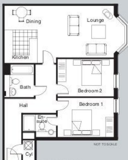
£239,950 APARTMENT 39

Two Bedroom Apartment Second Floor - 893 sq ft