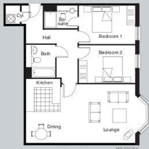
£265'000 APARTMENT 27

Three Bedroom Apartment Second Floor - 1000 sq ft