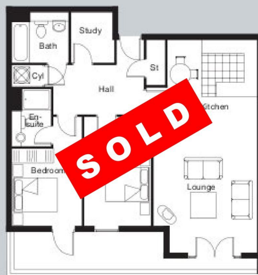
£286'000 APARTMENT 36 Two Bedroom Apartment Ground Floor - 982 sq ft