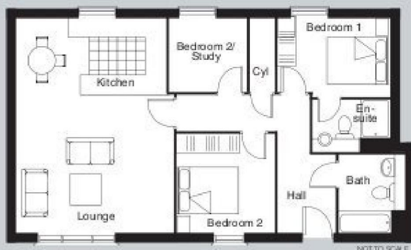
£312'500 APARTMENT 25

Three Bedroom Apartment Second Floor - 1000 sq ft