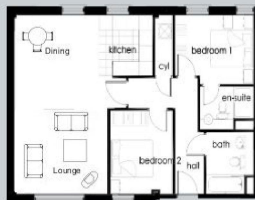
£299,950 APARTMENT 21

Two Bedroom Apartment First Floor - 857 sq ft