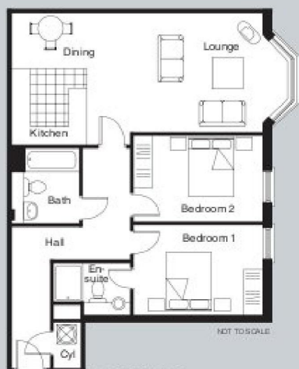
£269'950 APARTMENT 44 Two Bedroom Apartment Second Floor - 857 sq ft