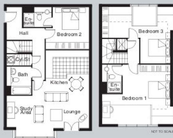
£425'000 APARTMENT 60 Three Bedroom Apartment Third/Fourth Floor - 1410 sq ft