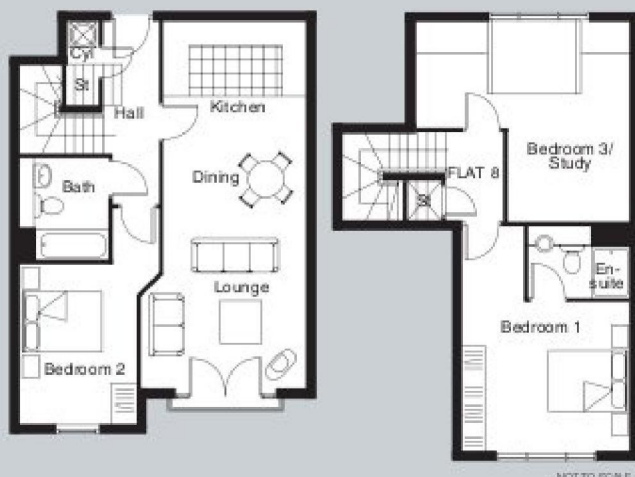
£323'000 APARTMENT 59 Three Bedroom Apartment Third/Fourth Floor - 1136 sq ft