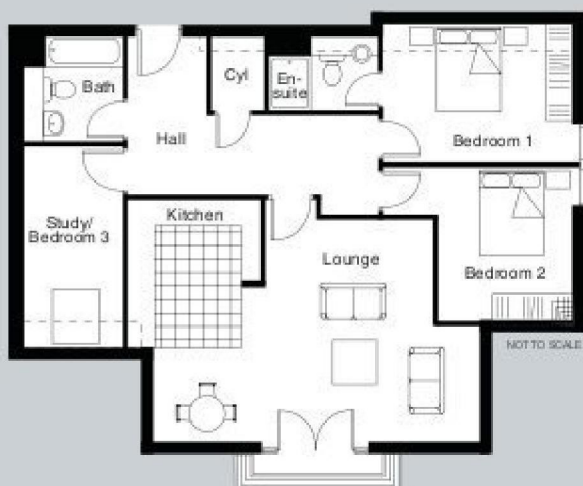
£329,950 APARTMENT 50

Two Bedroom Apartment First Floor - 982 sq ft