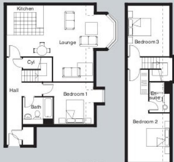
£395'000 APARTMENT 49 Three Bedroom Apartment Third/Fourth Floor - 1281 sq ft